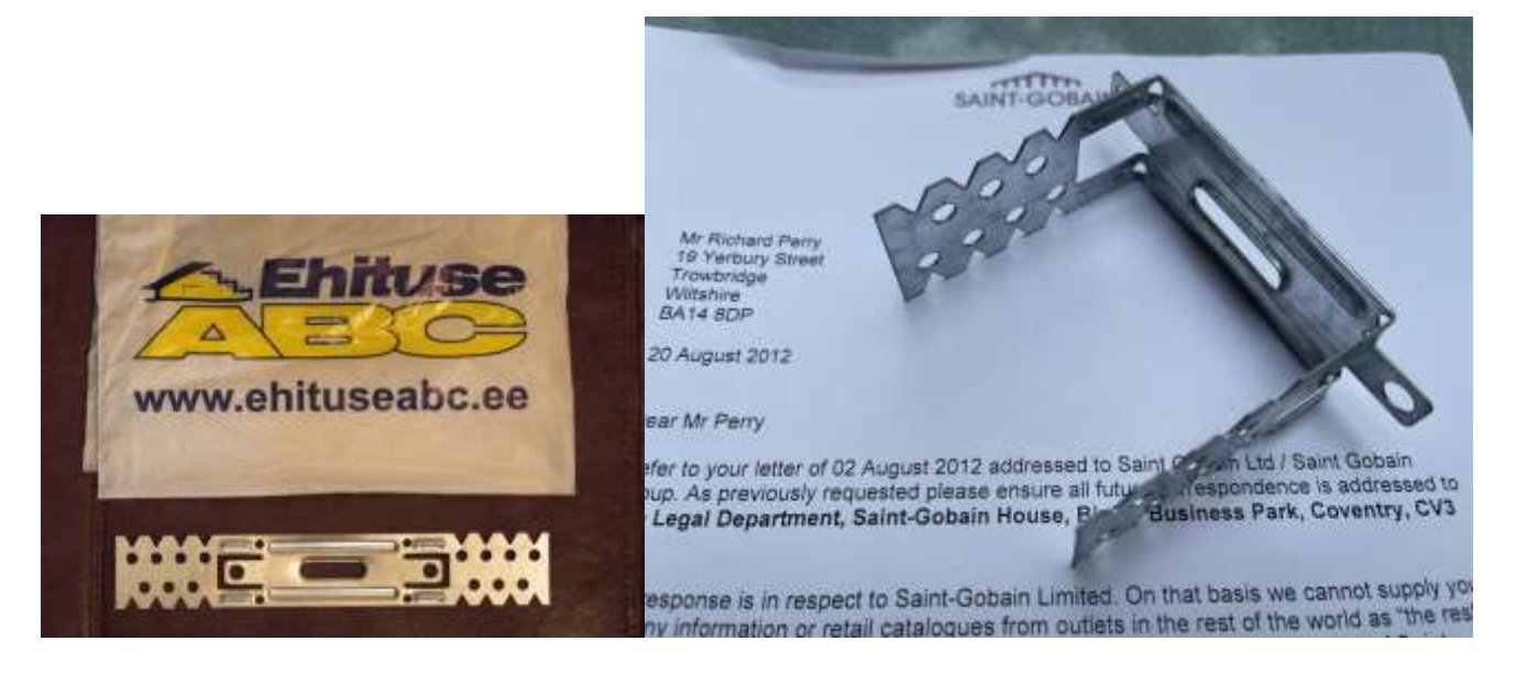
4). Saint Gobain and several of their subsidiaries - worldwide

These companies are committing worldwide criminal conspiracies to steal and defraud IP rights and stealing billions of pounds worth of assets from me and from other investors investing in IP rights, as well as the people