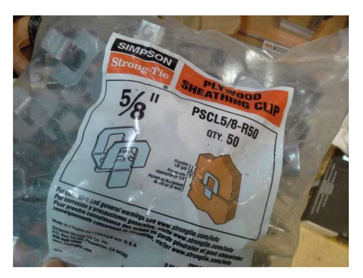
3). Simpson Strong Tie – worldwide